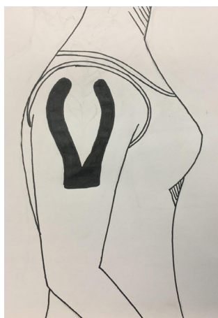
Figure 2. the first KT