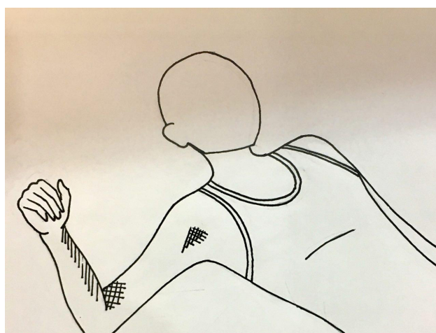
Figure 1. starting position of the test

on the wristband, with the arm held at 90 degrees of abduction and 0 degrees of internal and external rotation (right arm for right-handed and left arm for left-handed people) and elbow at 90 degrees of flexion (figure 1). While the athletes' eyes were shut, their arm was held at 30 degrees external rotation for 5 seconds, and then returned to its initial position. After 15 seconds of rest, the athletes were asked to reconstruct the move three times. Next, the reconstruction of the move was repeated at 60 degrees. Mean score of the three repeats was used in statistical analysis.