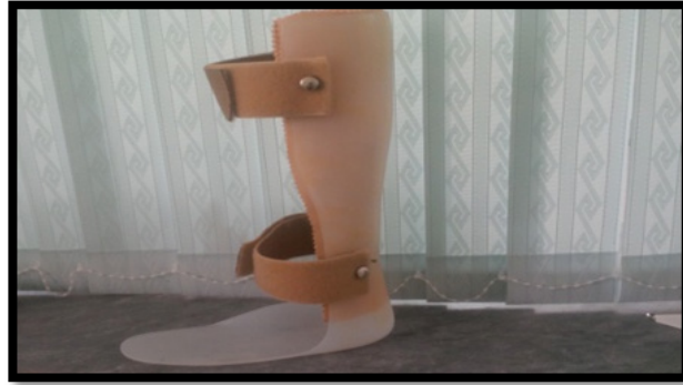
Figure 1. Neutral ankle angle and full-length foot-plate – conventionally aligned AFO(CAFO)

3) 5°dorsiflexion ankle angle and full-length foot-plate (5°DF AFO) (Figure 3)