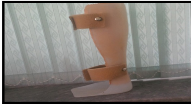
Figure 2. Neutral ankle angle and \frac{3}{4} length foot-plate ( \frac{3}{4} AFO)