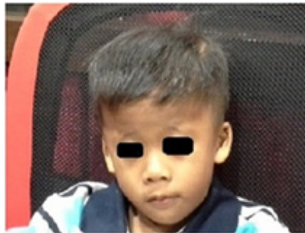
Fig 1. Facial characteristic of the 5-year old malay boy with NS

Based on the routine hearing tests, there was clear evidence that the child had conductive hearing loss. He was then referred to an otorhinolaryngologist for medical treatment. Due to the remarkable results in ABR, he was also referred for head imaging to verify the findings of ABR. He has been having regular visits to a speech pathology clinic to improve his speech and language abilities.